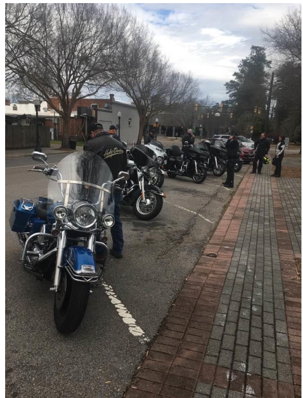
Chapter Ride to the Pizza Joint 2/6/2021

If I've forgotten you, I'm so sorry! Please email your birthday to jlewis@harley-haven.net so I can be sure